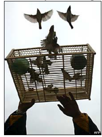
Buddhist healing ceremony

that for anyone to truly recover from horrific trauma they must find a deep sense of purpose and meaning in life. In those so inclined,